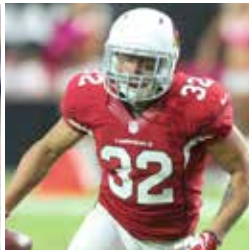
Tyrann Mathieu DB Arizona Cardinals