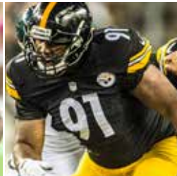
Stephon Tuitt DL Pittsburgh Steelers