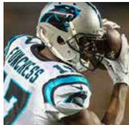
Devin Funchess WR Carolina Panthers