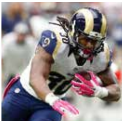
Todd Gurley RB Los Angeles Rams