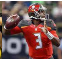
Jameis Winston QB Tampa Bay Buccaneers